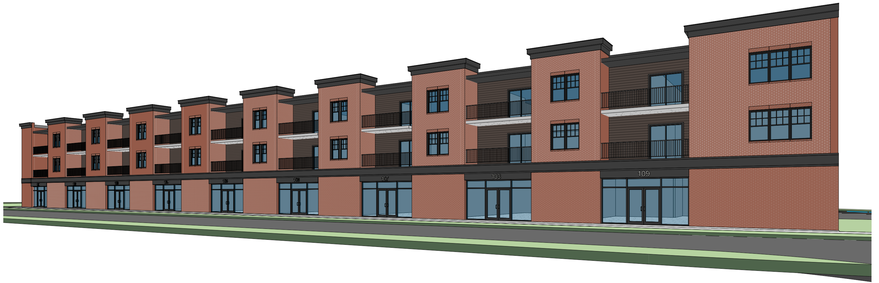
1 3D View 2