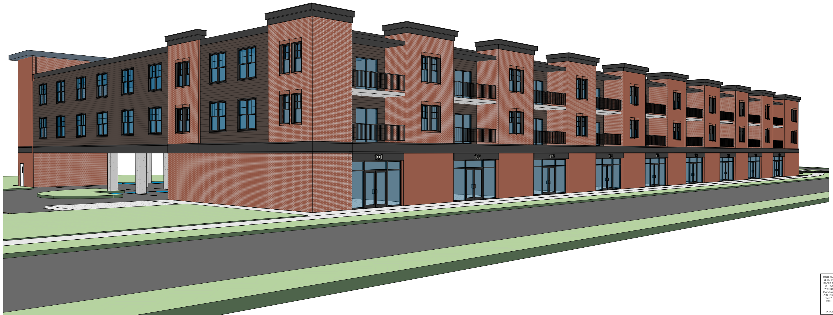
① 3D View 1